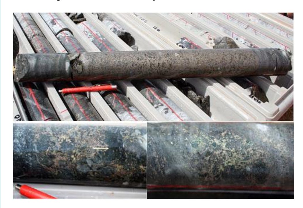
Figure 1 Samples of sulphide intersections at Innouendy